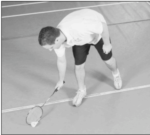
Figure 1.11 Shuttle scoop.

Use the handshake grip with your palm up. Pick or scoop up a bird lying on the floor, attempting to keep the bird on the racket face. Place your racket face next to the bird with the racket face held nearly parallel to the floor (figure 1.11). Slide the racket quickly under the bird with a scooping action, allowing the wrist to roll under and catching the bird on the racket face. Right-handed players usually do this from the right side of the bird. Complete five repetitions.