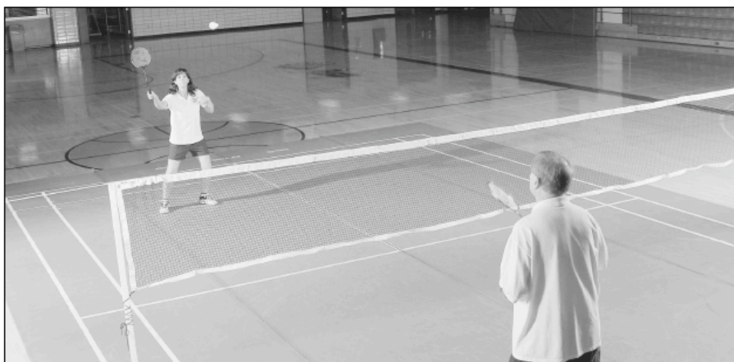
Figure 7.4 Continuous drive rally drill.