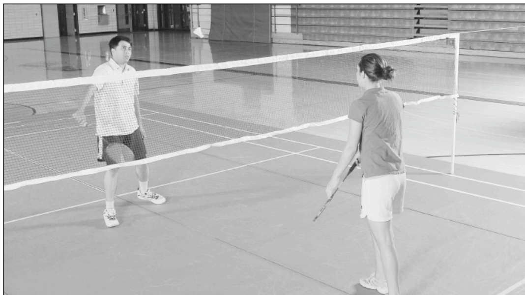
Figure 5.8 Hairpin drop shot at the net drill.

Reprinted, with permission, from T. Grice, 2008, Badminton: Steps to success , 2nd ed. (Champaign, IL: Human Kinetics), 72.